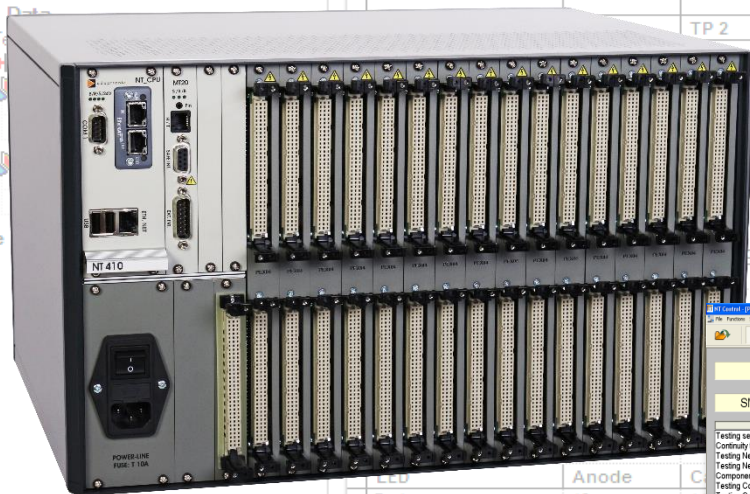
Example: NT 410