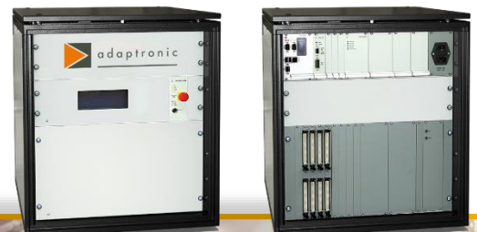
NT 700-3 (front / rear) with options

The high reliability of the adaptronic test systems, our quick response service and more than 30 years of experience make a convincing contribution to the quality assurance of your products.