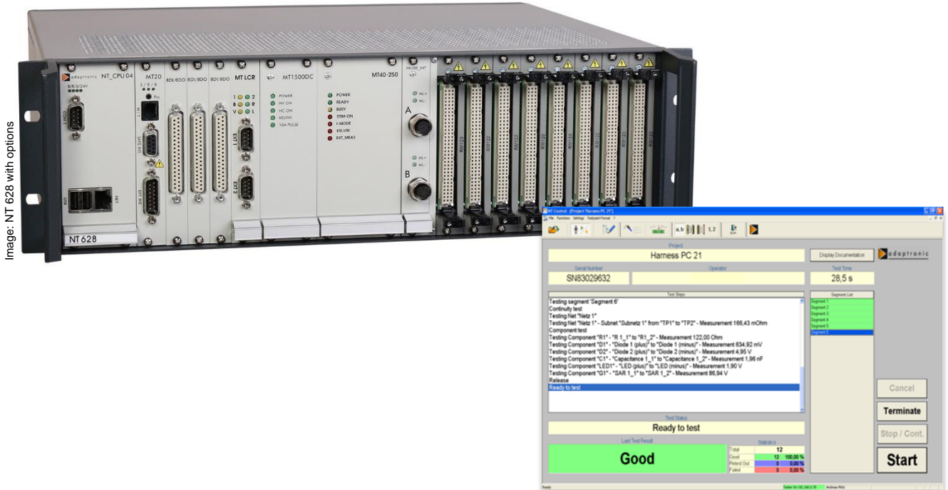
Image: NT 628 with options