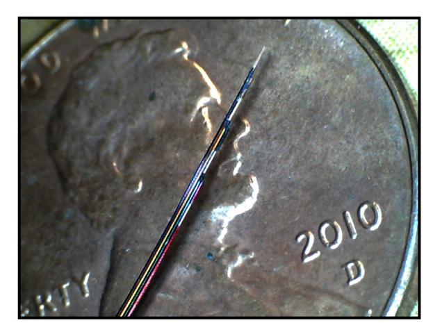
Laser stripped micro ribbon cable

Featuring ultra-violet laser technology, the Odyssey strippers vaporize any polyimide-type insulation cleanly and precisely, whilst harmlessly reflecting from the shield or conductor, giving a perfect, nick-free strip every time. Unlike competing laser technologies no residue is left, so it is possible to connect to the wire without further chemical treatment.