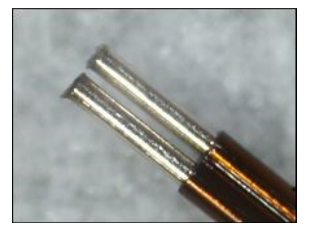
Enamelled bi-filar stripped and cut by an Odyssey system

Laser Wire Solutions' Odyssey laser wire strippers are tailored to the needs of polyimide coated type wires used in electrophysiology electrodes.