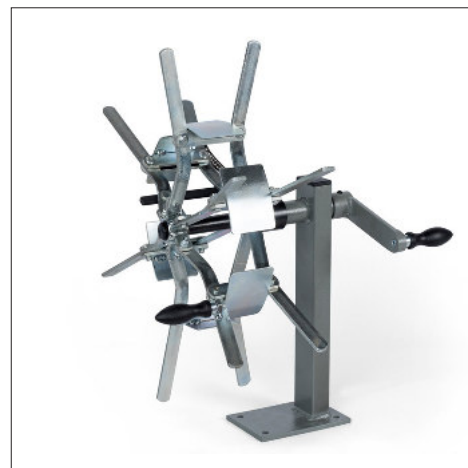
Fig. 3 TISCHROL 1:1 with RAPID 450 SP