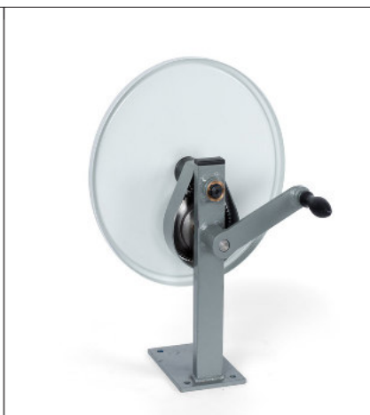
Fig. 2 TISCHROL Complete device, backside