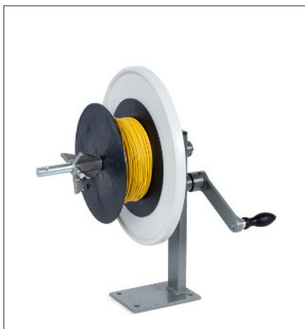
Fig. 1 TISCHROL Complete device consisting of TISCHROL 1:3 and spool winding axle