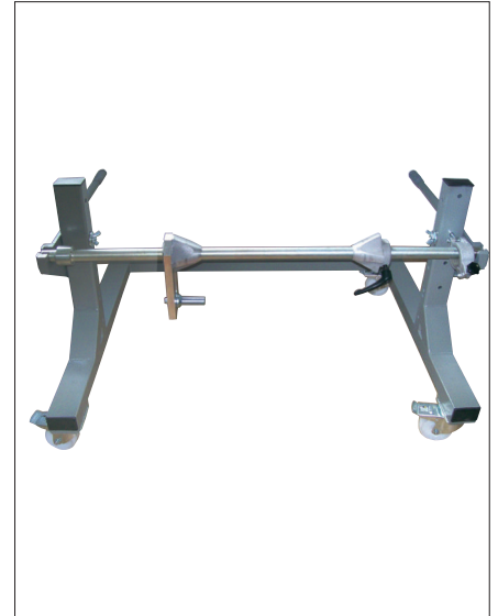
Fig. 3 TROMTRAK 1250 with adjustable driving pin