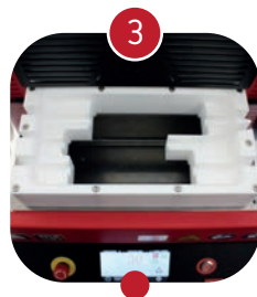
Bigger shrinking chamber comparing to standard STCS-VMir: 225mm x 100mm