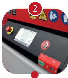
USB and Ethernet sockets for network communication