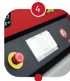
New and improved interface based on Touchscreen technology, that allows network communication